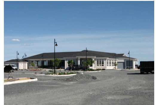
Marina Club—May 19, 2008

Summerbration is scheduled for Saturday July 5 th . Come and join us for